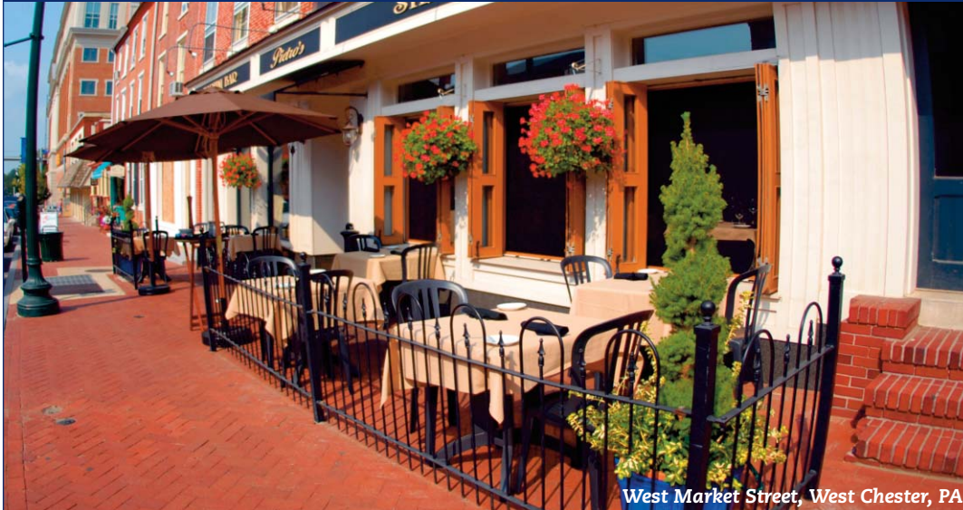
West Market Street, West Chester, PA