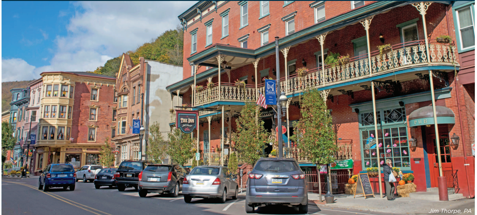
Jim Thorpe, PA

GOVERNOR'S CENTER FOR LOCAL GOVERNMENT SERVICES