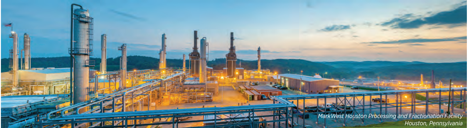
MarkWest Houston Processing and Fractionation Facility Houston, Pennsylvania