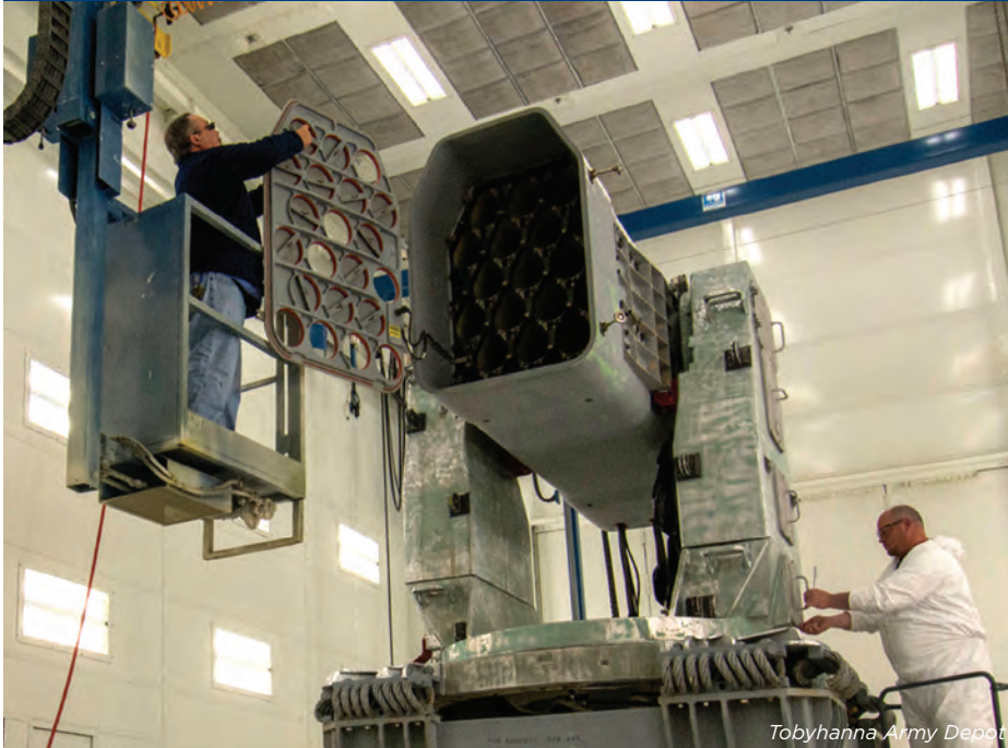
Tobyhanna Army Depot